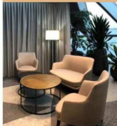
Holding rooms to host VIPs

Under pleasant natural daylight or the romance of the night skies, beautiful trees located amid Cloud9 Piazza add to the idyllic garden setting of events. Events enjoy privacy provided by majestic full height garden hedges, which make for picturesque backdrops of greenery. Located at the two ends of the plaza are two (2) glass house private rooms, suitable for private hosting of guests or use in between events.