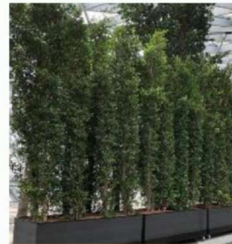
Hedges for Privacy