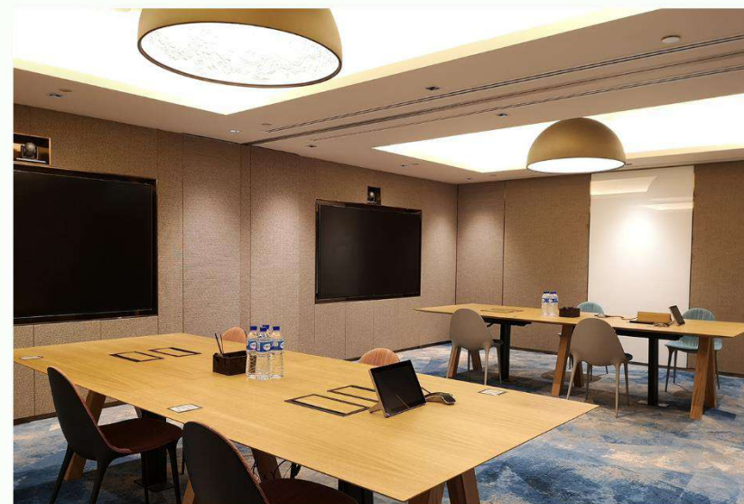
Well-equipped meeting room

Nestled within the luxurious privacy of Changi Lounge are well-equipped private meeting rooms that are suitable for corporate meetings in an exclusive and cosy setting. Each meeting room can accommodate up to 8 persons and comes with beverages and meal options. For larger capacity, combine two meeting rooms into a single one that can accommodate up to 16 persons.