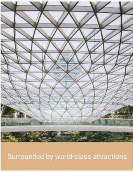
Surrounded by world-class attractions