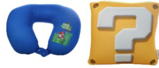
2-in-1 Cushion & Neck Pillow Design 2