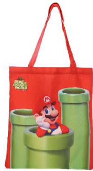
Canvas Bag Design 2