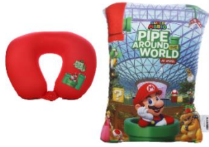
2-in-1 Cushion & Neck Pillow Design 1