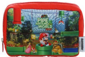
Travel Pouch Design 1