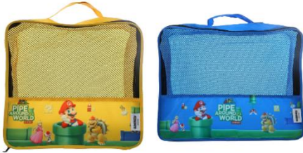
3-in-1 Organiser Design 1