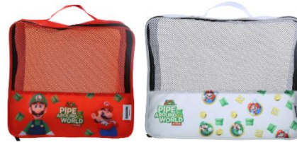
3-in-1 Organiser Design 2