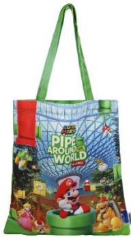
Canvas Bag Design 1