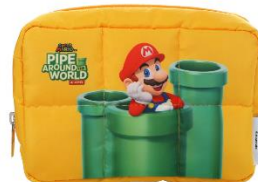
Travel Pouch Design 2