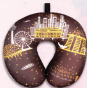
Discover Singapore SG Traveller Neck Pillow