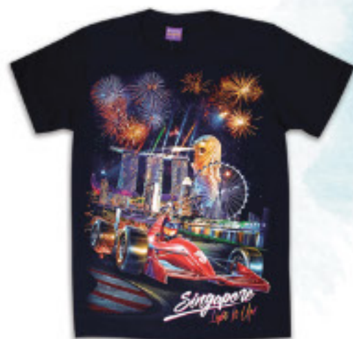
Discover Singapore Singapore F1 Race T-shirts

Singapore, being a clean and green garden city, was envisioned by our then Prime Minister Mr Lee Kuan Yew in 1967.