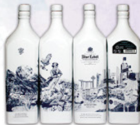
DFS JW Exclusive Willow Collection