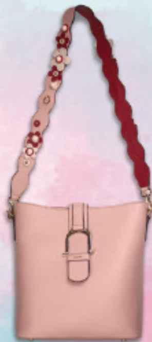
BONIA Natural Light Pink Tote with Floral Bag Strap