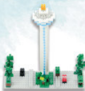
Times Travel Brixies (Singapore series) Changi Control Tower